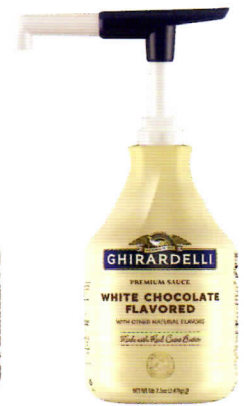
White Chocolate Flavored