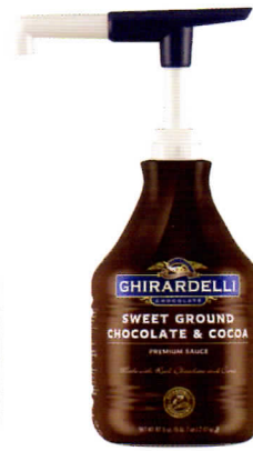
Sweet Ground Chocolate & Cocoa