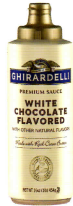
White Chocolate Flavored