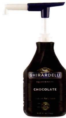
Black Label Chocolate