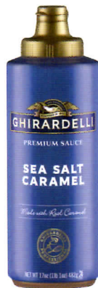
Sea Salt Caramel