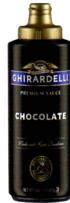
Black Label Chocolate