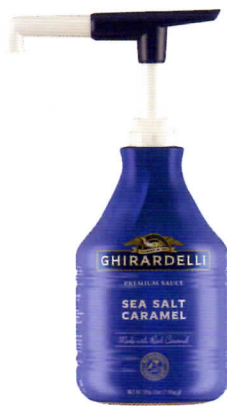
Sea Salt Caramel